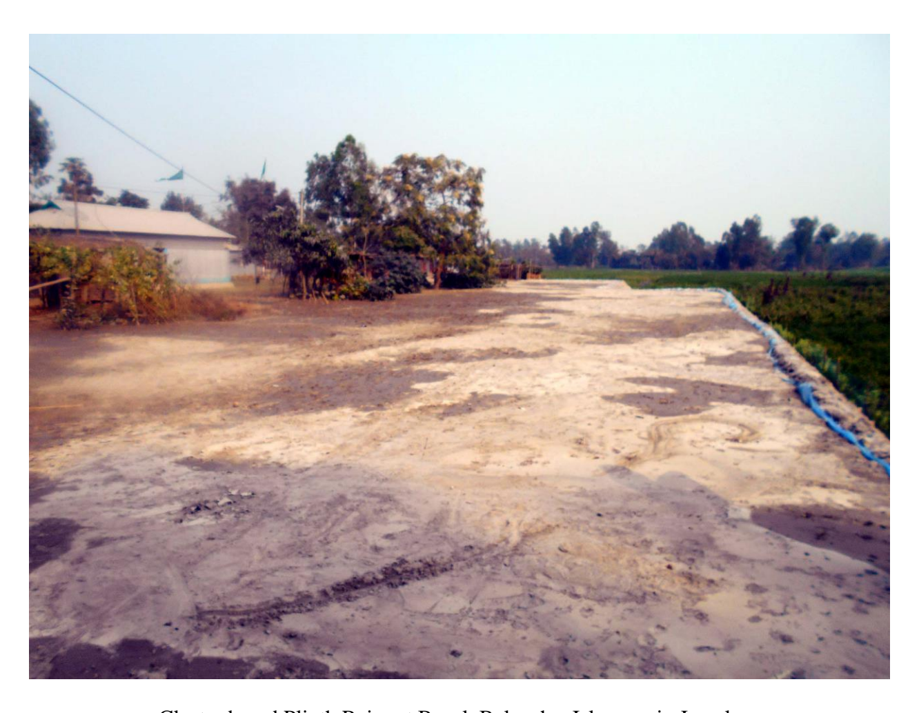
Cluster based Plinth Raise at Borol, Belgacha, Islampur in Jamalpur