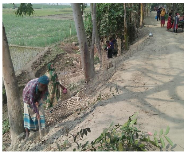
Grass & tree planting to protect the road from flood at Kulkandi, Islampur.