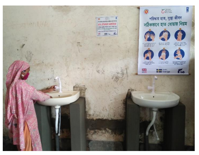
Use of hand washing point to protect against COVID-19 at Belgachha Flood Shelter center

The intervention was designed by the Sub Assistant Engineer, PIO Office, DDM at Islampur through identify the need with UDMC. The office also supported in the post works measurement. As a joint effort from