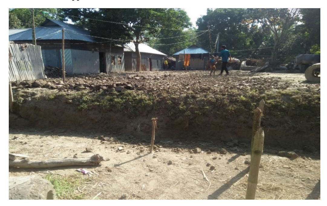
Plinth raise through a community approach at Dhontotla, Belgacha, Islampur in Jamalpur

employment. Besides this, they have been endowed with their individual sanitation & tube-well through a cluster based approach.